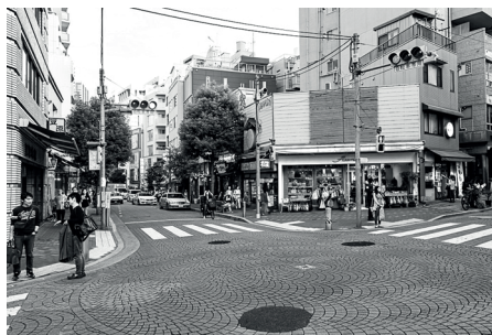
Azabu-Juban Street (#)

Here, Tokyo is not as crowded as it is in Shinjuku or Shibuya, and there is a pleasant mix of traditional and newer restaurants, and shops offering basically local food specialties, such as grilled eel, taiyaki (fish-shaped cakes filled with a sweet paste made out of beans) or soba noodles. www.azabujuban.or.jp