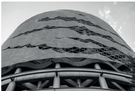
Joule A Building

Right on the crossroads, a rather extraordinary building will catch your eye. Its façade, made of perforated aluminium plates, looks like it has been torn apart. The building was designed by architect Edward Suzuki , a Harvard graduate, and completed in the final phase of the economic boom.